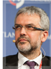
Jiří Schneider First Deputy Minister of Foreign Affairs, Prague;